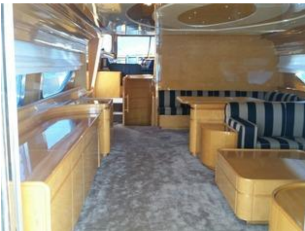
Main Salon Overview