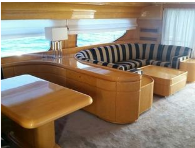
Main Salon & Dining