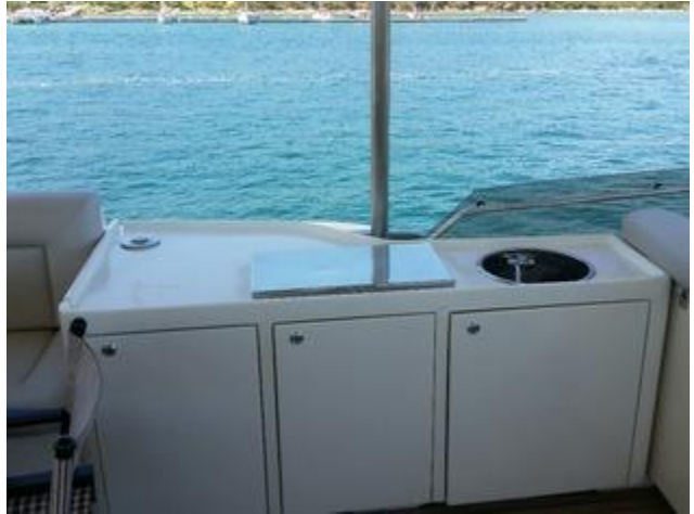
Sun Deck Details